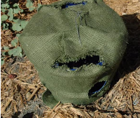
Figure 12. Homemade R. ferrugineus trap covered with burlap (Image courtesy of Amy Roda, USDA-APHIS).