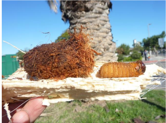
Figure 3. Prepupa of R. palmarum that was taken from its pupal cocoon (Image courtesy of Center for Invasive Species Research, University of California, Riverside).

After hatching, larvae bore into the stem where they tunnel vertically between the vascular bundles (Hagley, 1965). The larvae of R. palmarum feed on live