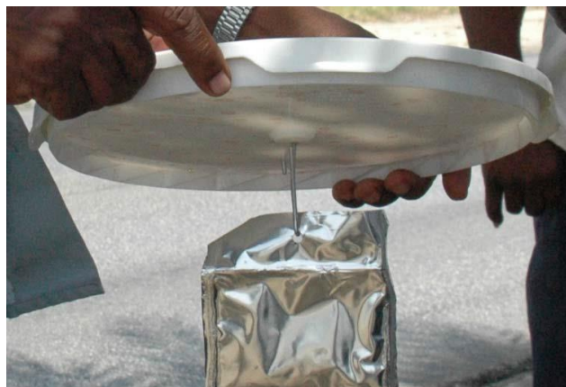
Figure 14. Lid of homemade bucket trap with hanging lure (Image courtesy of Amy Roda, USDA-APHIS).

Completely cover the food bait with a liquid solution. The liquid is critical as the weevils are attracted to the humidity and it prevents the weevils from crawling out of the trap. A 50 to 50 solution of propylene glycol (low-toxicity anti-freeze such as RV & Marine Antifreeze) and water helps minimize evaporation and the chance of the trap drying and the beetles escaping. Enough water and propylene glycol should be added to completely cover the bait and in a quantity that will remain until the next servicing date. Surrounding environmental conditions will dictate how quickly the