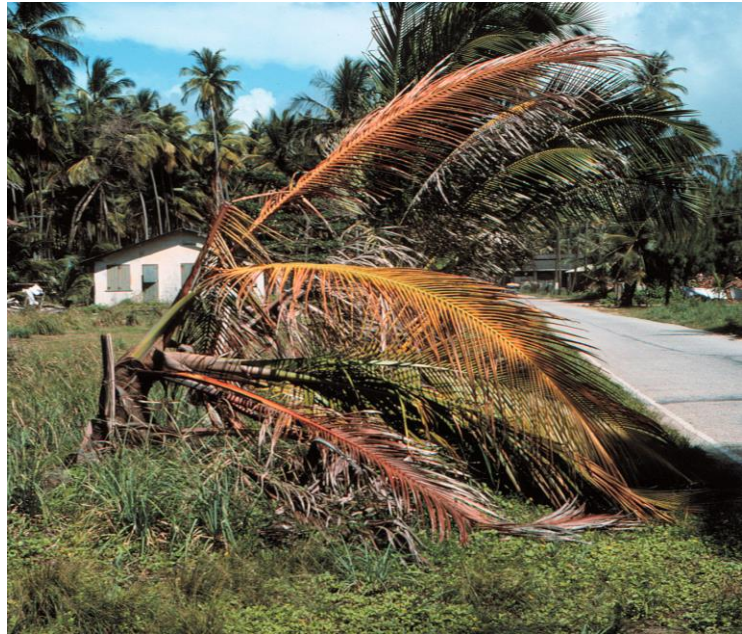
Figure 10. Coconut palm with red ring disease, Trinidad (Image courtesy of Robin Giblin-Davis, University of Florida).

In addition to directly damaging plant tissue, R. palmarum is the vector of the nematode Bursaphelenchus cocophilus (Griffith, 1987; Brammer and Crow, 2002). Bursaphelenchus cocophilus is the causal agent of the red-ring disease, which causes serious economic losses in palm plantations in South and Central America. Only female adults vector the nematode Bursaphelenchus cocophilus . Adult female weevils, which are internally infested with B. cocophilus , disperse to a healthy coconut palm and deposit the juvenile stage of the nematode during oviposition. Nematodes enter the wounds, feed, and reproduce in the palm tissues, causing the death of the infected trees. The weevil larvae are parasitized by juveniles of B. cocophilus , which persist in the insect through metamorphosis (EPPO, 2005).