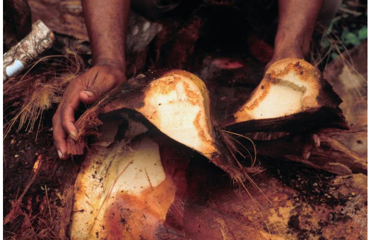
Figure 11. Coconut palm petioles with red ring disease, Ecuador (Image courtesy of Robin Giblin-Davis, University of Florida).

The infective stage of the nematode can be found internally in the tracheal sacs or in the hemocoel among the gut tract loops. From these locations, the infective stage moves to the ovipositor of adult female weevils (Griffith, 1987). The adult weevils emerge from their cocoons in the rotted palm and disperse to apparently healthy or stressed and dying palms, completing the life-cycle. This pathogen can cause death of the plant 3-4 months after symptoms are evident (EPPO, 2005).