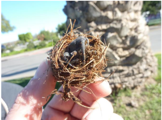
Figure 4. R. palmarum adult emerging from a pupal cocoon (Image courtesy of Center for Invasive Species Research, University of California, Riverside).