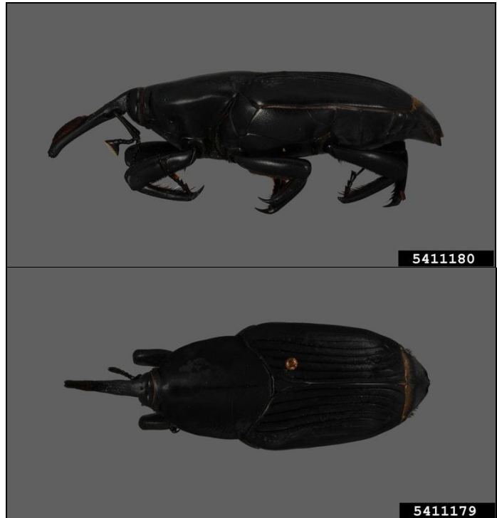
Figures 1 & 2. Adult R. palmarum.

Larvae: “The larva is typically eruciform and [caterpillar-like and legless], and is 2.40 \pm 0.001 mm [0.09 in] long and 0.94 \pm 0.014 mm [0.04 in] wide in the first instar. The head is rich orange brown and bears a pair of stout mandibles. The abdomen is creamy white and semitransparent, each segment bearing distinct tufts of lateral setae. The later instars vary considerably in size. The mature larva is 51 \pm 5.6 mm [5 in] long and 25 \pm 3.8 mm [0.98 in] wide, with a [head] width of 8.06 \pm 0.43 mm [0.3 in]. At this stage the cuticle becomes considerably darker,