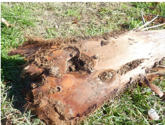
Figure 5. Palm frond damage caused by R. palmarum (Image courtesy of Center for Invasive Species Research, University of California, Riverside).

Infested palms show a progressive yellowing of the foliage. The emerging leaves are destroyed, and flowers are necrotic. The leaves dry out in ascending order in the crown, and the apical leaf bends and eventually drops. Galleries and damage to leaf-stems made by the larvae are easily detected in heavily infested plants. In coconut, larval tunnel openings and frass can be found at the bases of the leaf