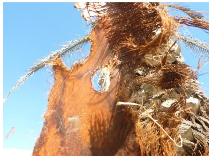
Figure 6. Damaged palm frond caused by R. palmarum (Image courtesy of Center for Invasive Species Research, University of California, Riverside).