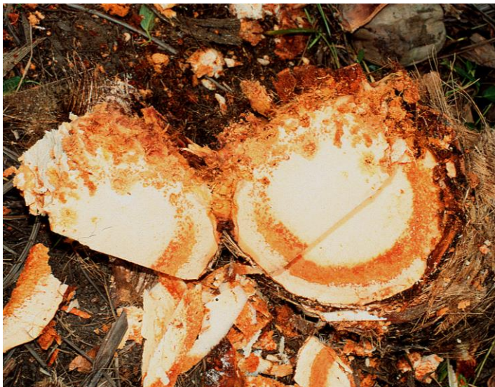
Figure 8. Red ring disease on coconut palm with R. palmarum galleries, Ecuador.