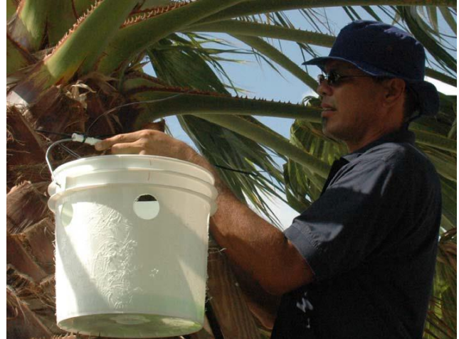
Figure 13. Homemade R. ferrugineus trap with entrance holes (Image courtesy of Amy Roda, USDA-APHIS).