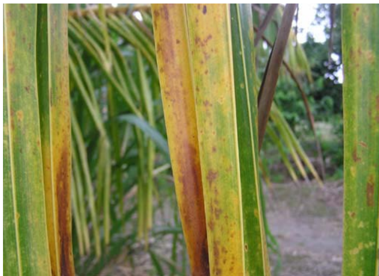
Figure 4. Detail of chlorosis and necrosis on coconut fronds, Dominica, 2005.