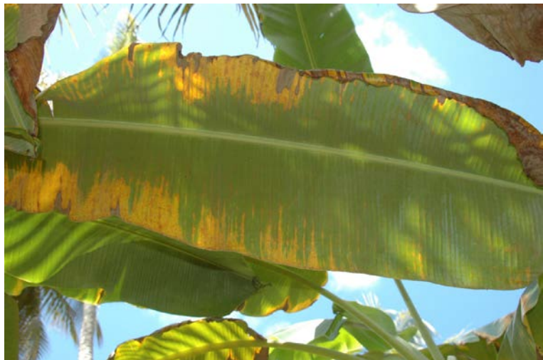
Figure 6. The discolored areas on the underside of this banana leaf are where red palm mites have caused damage to the plant (Image courtesy of Amy Roda, USDA-CPHST).