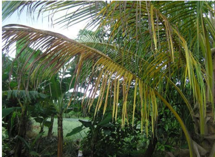
Figure 3. Chlorosis and necrosis of pinnae (leaflets) appears to be more pronounced on basal fronds of coconut palms on the island of Dominica (J.E. Peña, University of Florida).

Raoiella indica causes serious leaf damage which ruins the ornamental value of host material (Pons and Bliss, 2007). This species is considered a significant pest in Egypt, Mauritius, and the Philippines (Pons and Bliss, 2007) specifically on coconut (André Moutia, 1958). Since its discovery in the New World, this species has become a major concern to both the coconut and banana industries (Taylor et al., 2011).