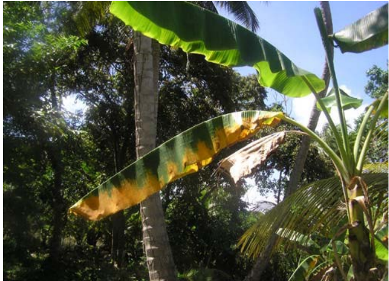
Figure 5. Banana leaf showing signs of infestation by the red palm mite, Trinidad, 2006.

Raoiella indica poses a significant threat to the United States' banana, coconut, and palm industries (USDA, 2007). NAPPO (2007) states that this mite is considered a direct threat to both the ornamental palm and coconut industries found in Alabama, Arizona, California, Florida, Hawaii, Puerto Rico, and Texas. Although most information available on R. indica deals with its relationship with Cocos nucifera (coconut), it could also have potentially negative effects on other hosts present in the New World. Its recent find in Florida could affect the Florida palm industry which has $200 million in annual sales and represents 7% of total Florida nursery sales (FDACS, 2009).